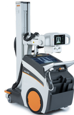
IMAGE SUITE Mini-PACS

Image acquisition and management for CR and DR Systems